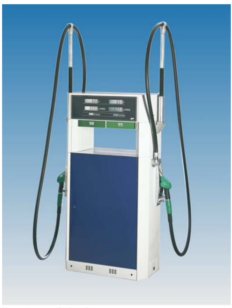
Hose masts are an optional extra item.