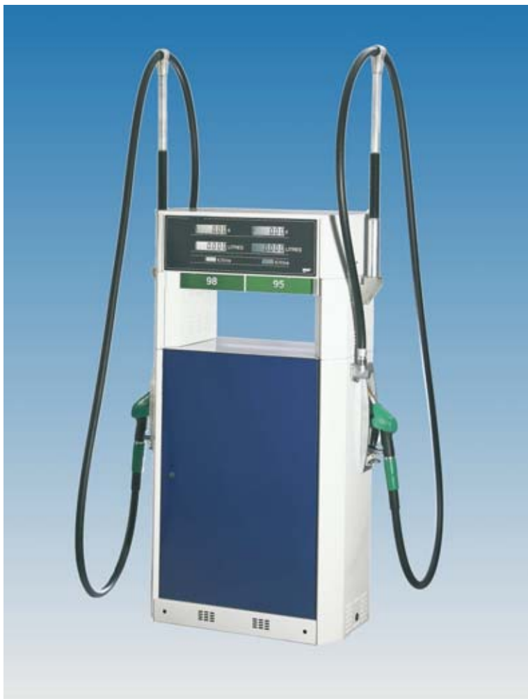
Hose masts are an optional extra item.